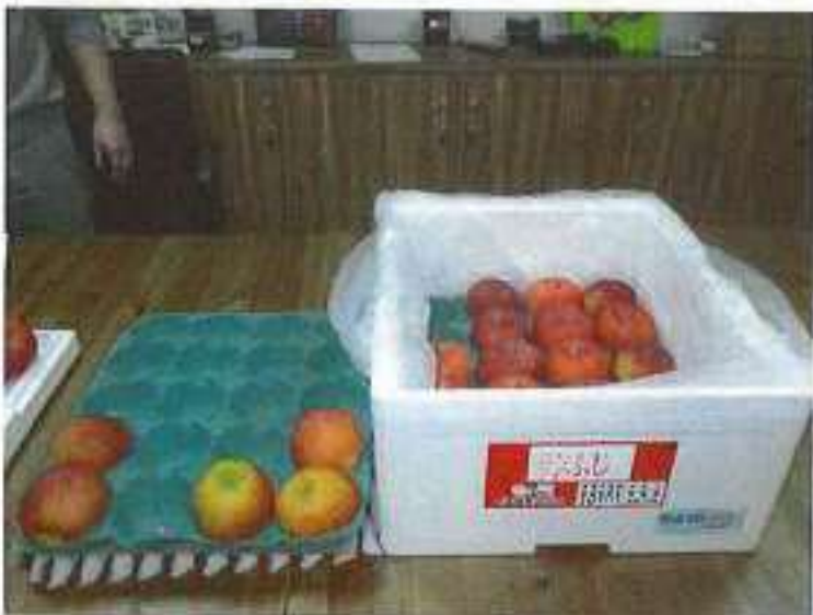
Photo No.14: ---- Ditto ---- The condition with ratio of damage: Stem Puncture: 3.8% Superficial Scald "YAKE": 2.5%