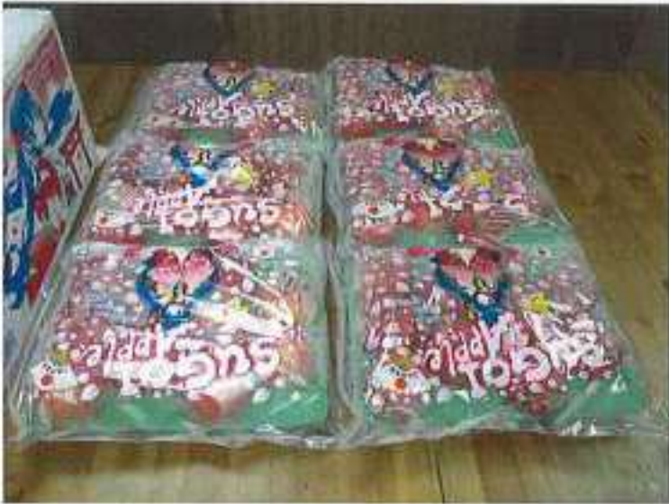
Photo No.35: ---- Ditto ---- Every 10 pcs. was put on a paper tray and was packed into colored plastic bag with sealing at the mouth.