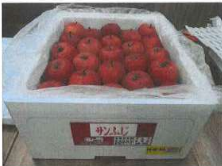
Photo No.40: Variety: Sun-Fuji, 2 nd grade with size: 46s: Unpacked for inspection.