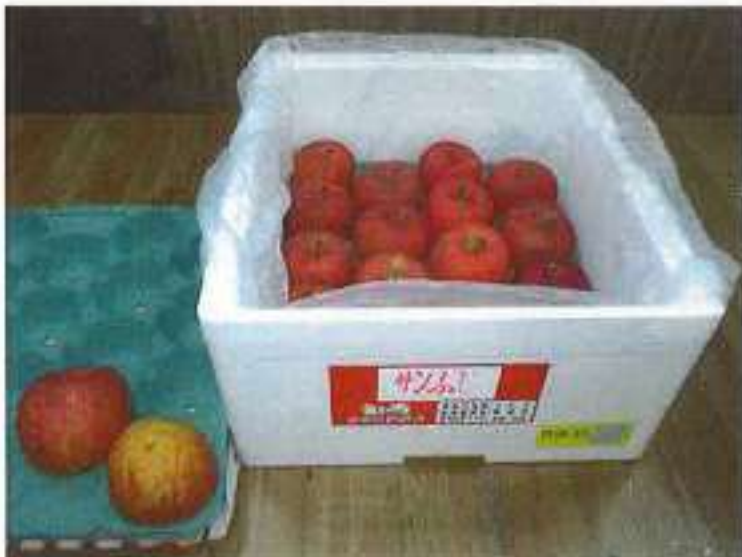
Photo No.23: --- Ditto --- The condition with ratio of damage: Stem Puncture: 3.1% Superficial Scald "YAKE": 1.6%