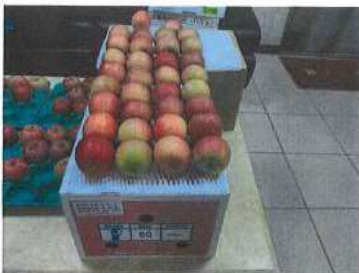
Photo No.25: Grade: A 1 st grade with size: 60s. The condition with ratio of damage: Stem Puncture: 1.7% Superficial Scald: 55.0%