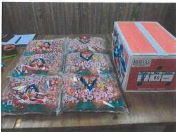
Photo No.22: Grade: A 1 st grade with size: 60s. Unpacked for inspection.