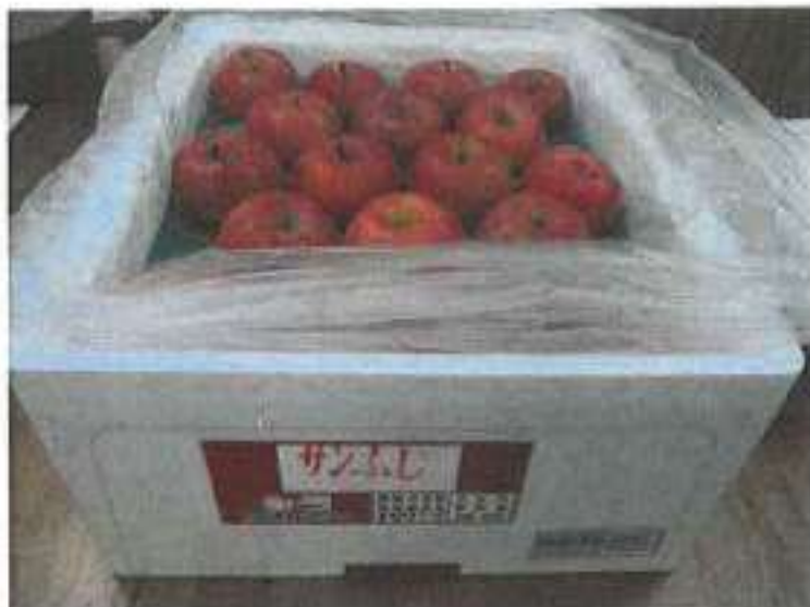
Photo No.13: Variety: Sun-Fuji, 3 rd grade with size: 36s: Unpacked for inspection.