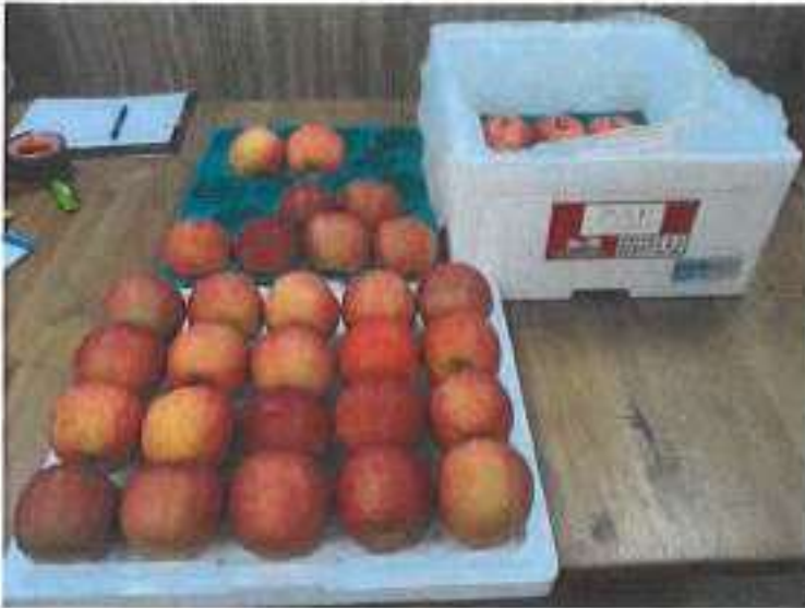
Photo No.19: Grade: Blue Tokusen 3 rd grade with size: 36s: The condition with ratio of damage: Stem Puncture: 2.8% Superficial Scald: 68.1%