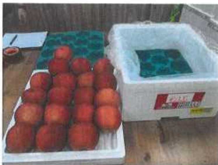
Photo No.4; Grade: Yellow Tokusen 2 nd grade with size: 28s. The condition with ratio of damage: Decay: 1.8% Superficial Scald: 64.3%