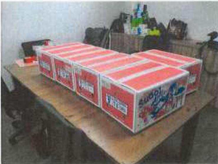
Photo No.49: Variety: Sugoí Sun-Fuji, 1 st grade with size: 72s: 5 cartons were sorted out at random for a further examination.