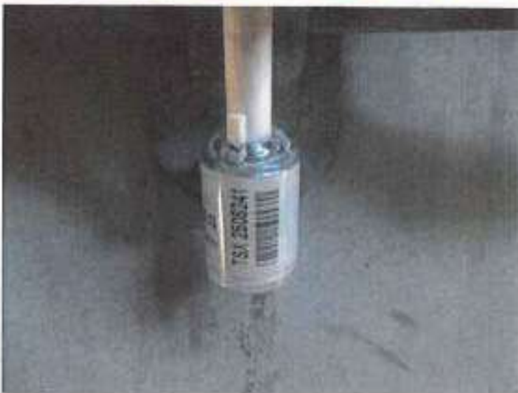
Photo No.2: ---- Ditto ---- The original seal bolt, No.TSX2508241, was kept intact on the container door.