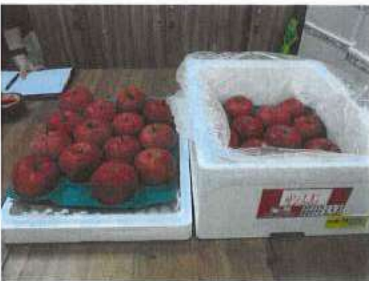
Photo No.3: Grade: Yellow Tokusen 2 nd grade with size: 28s. Unpacked for inspection.