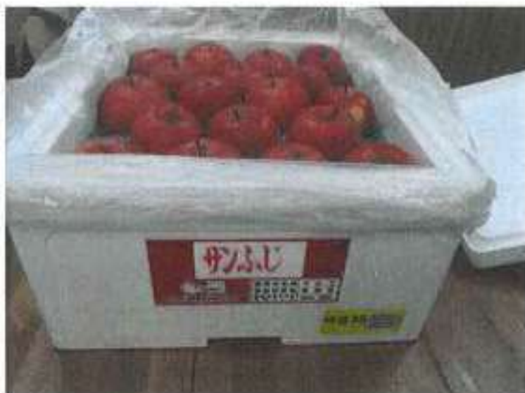
Photo No.34: Variety: Sun-Fuji, 2 nd grade with size: 36s: Unpacked for inspection.