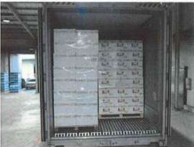
Photo No.2: ----- Ditto ----- The cargo was well stowed in the container and according to record of Ryan Recorder in the container, the inside temperature was kept at (+)1.0 -2.0°C on the way from Tokyo, Japan to Keelung, Taiwan.