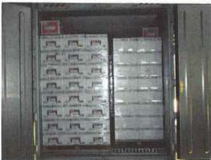
Photo No.3: ---- Ditto ---- The cargo was well stowed in the container and according to record of Ryan Recorder in the container, the inside temperature was kept at +1.0°C on the way from Kobe, Japan to Keelung, Taiwan.