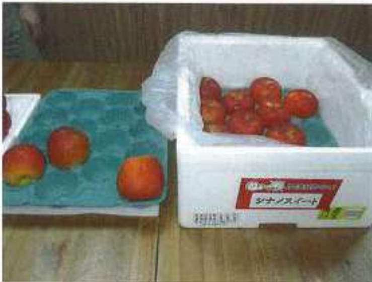
Photo No.29: ---- Ditto ---- The condition with ratio of damage: Stem Puncture: 7.1% Bruising: 3.6%