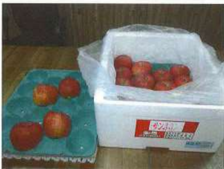
Photo No.8: --- Ditto --- The condition with ratio of damage: Stem Puncture: 4.7% Superficial Scald "YAKE": 6.3%