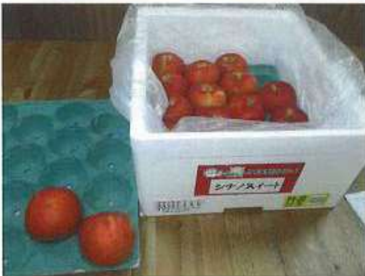
Photo No.32: ---- Ditto ---- The condition with ratio of damage: Stem Puncture: 4.7%