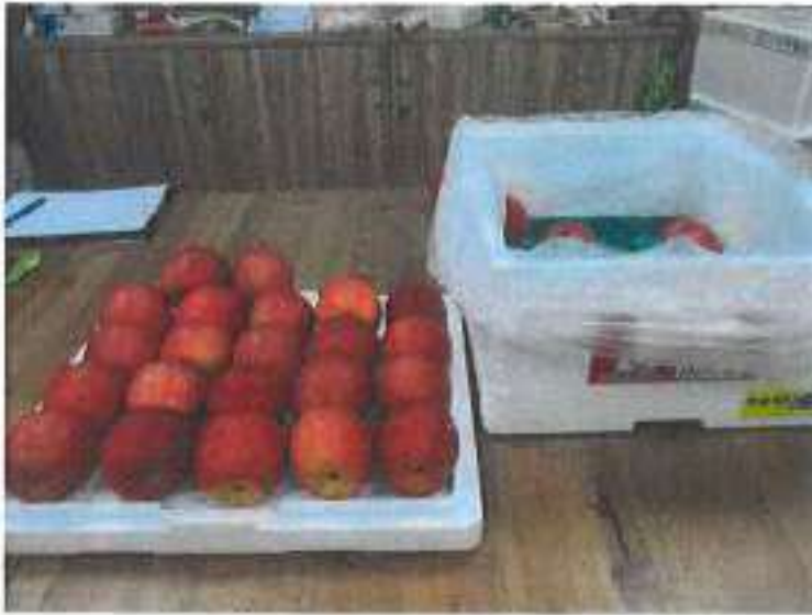
Photo No.10: Grade: Yellow Tokusen 2 nd grade with size: 40s. The condition with ratio of damage: Superficial Scald: 48.8%