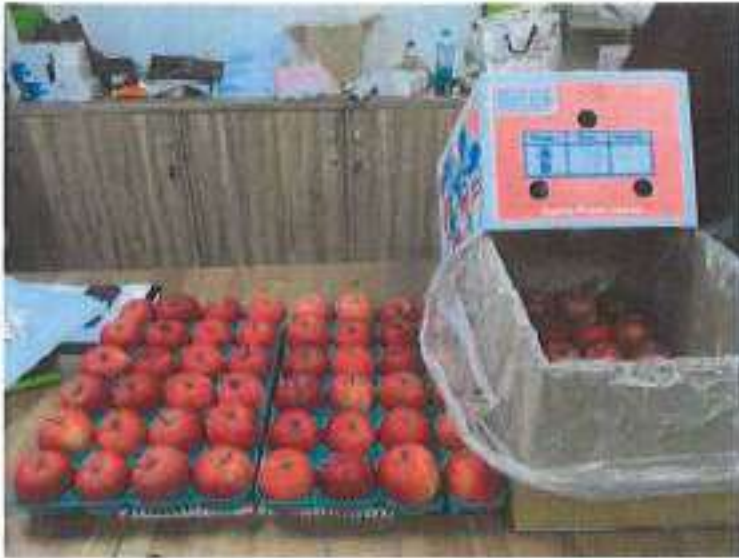
Photo No.28: Grade: A 1 st grade with size: 72s. Unpacked for inspection.