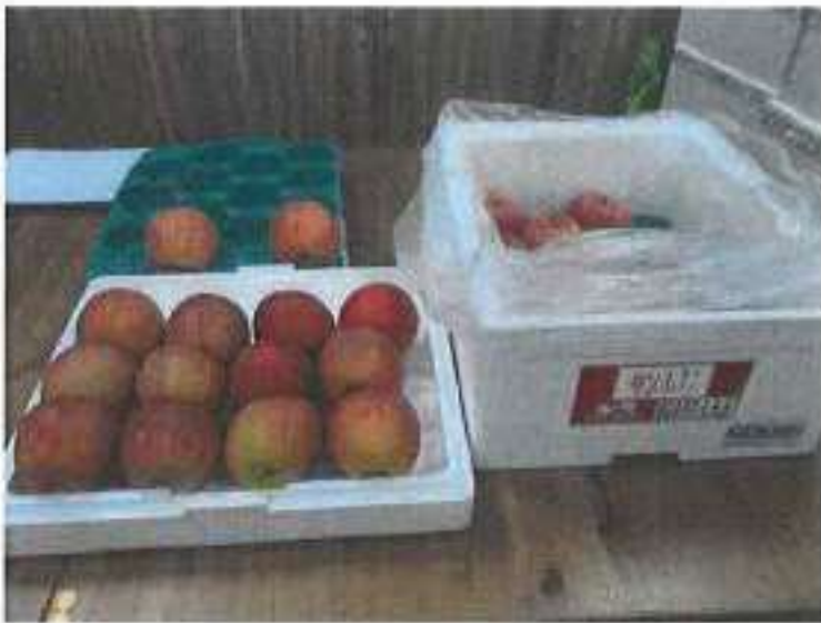
Photo No.13: Grade: Blue Tokusen 3 rd grade with size: 28s. The condition with ratio of damage: Stem Puncture: 7.1% Superficial Scald: 39.3%