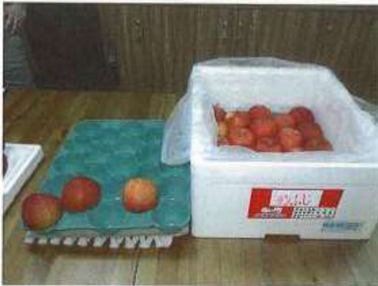
Photo No.17: ---- Ditto ---- The condition with ratio of damage: Bruising: 2.2% Superficial Scald "YAKE": 4.4%