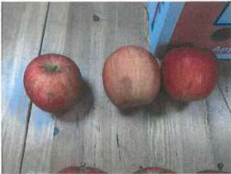
Photo No.31: ---- Ditto ---- Bruising and stem puncture (Close view)