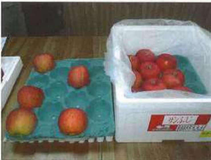
Photo No.20: --- Ditto --- The condition with ratio of damage: Stem Puncture: 8.9% Bruising: 3.6% Superficial Scald "YAKE": 3.6% Bitter Pit: 1.8% Rotten: 1.8%