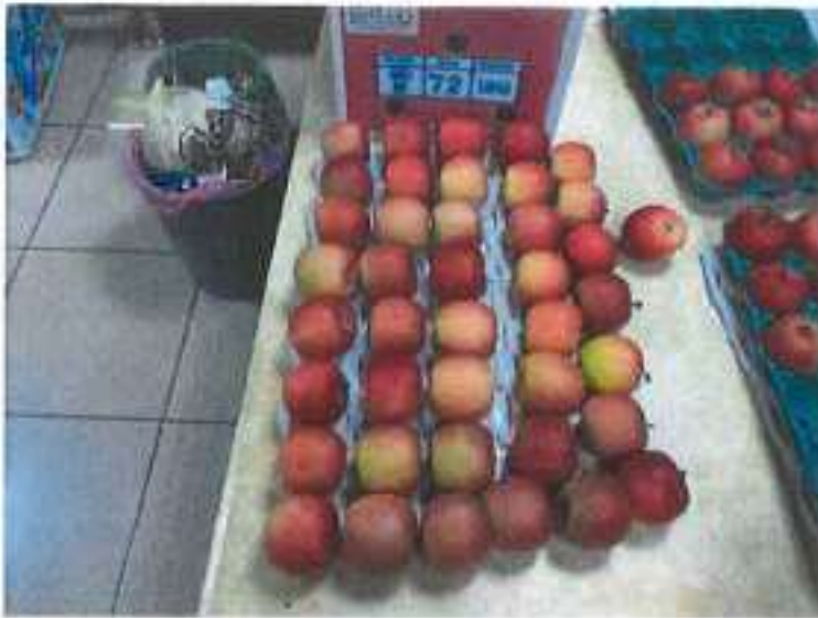
Photo No.28: Grade: A 1 st grade with size: 72s. The condition with ratio of damage: Bruising: 1.0% Superficial Scald: 59.7%