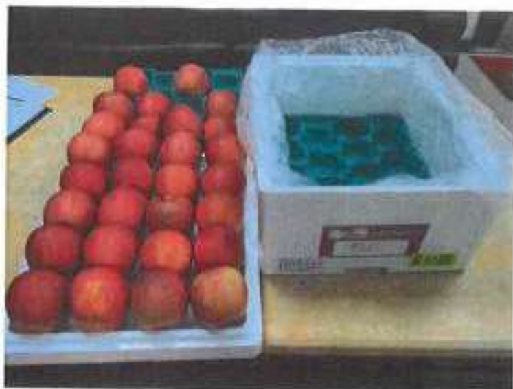
Photo No.4: Grade: Yellow Tokusen 2 nd grade with size: 32s. The condition with ratio of damage: Stem Puncture: 1.6% Bruising: 1.6% Superficial Scald: 81.3%