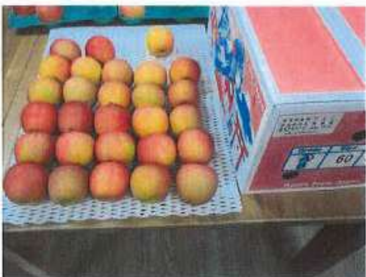
Photo No.24: ----- Ditto ----- The condition with ratio of damage: Stem Puncture: 1.7% Superficial Scald: 45.0%