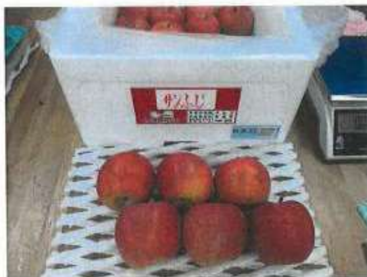
Photo No.8: ---- Ditto ---- The condition with ratio of damage: Stem Puncture: 3.1% Superficial Scald: 9.4% Bruising: 1.6%