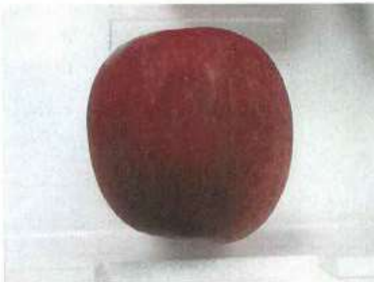
Photo No.26: ---- Ditto ---- Bruising in another carton. (Close view)