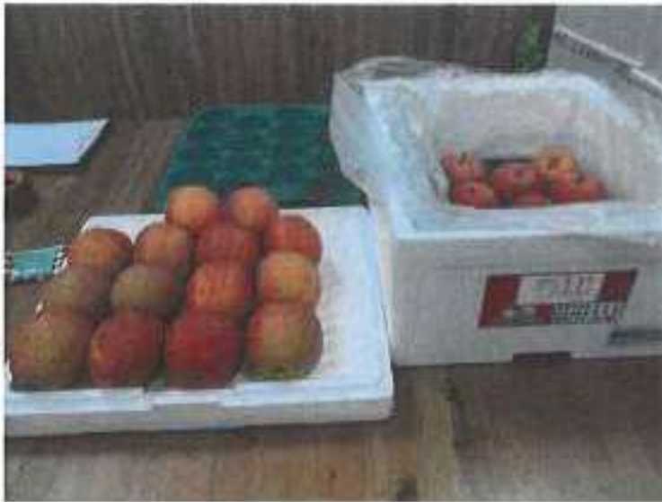
Photo No.16: Grade: Blue Tokusen 3 rd grade with size: 32s. The condition with ratio of damage: Superficial Scald: 43.8%