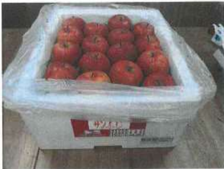
Photo No.7: Variety: Sun-Fuji, 3 rd grade with size: 32s: Unpacked for inspection.