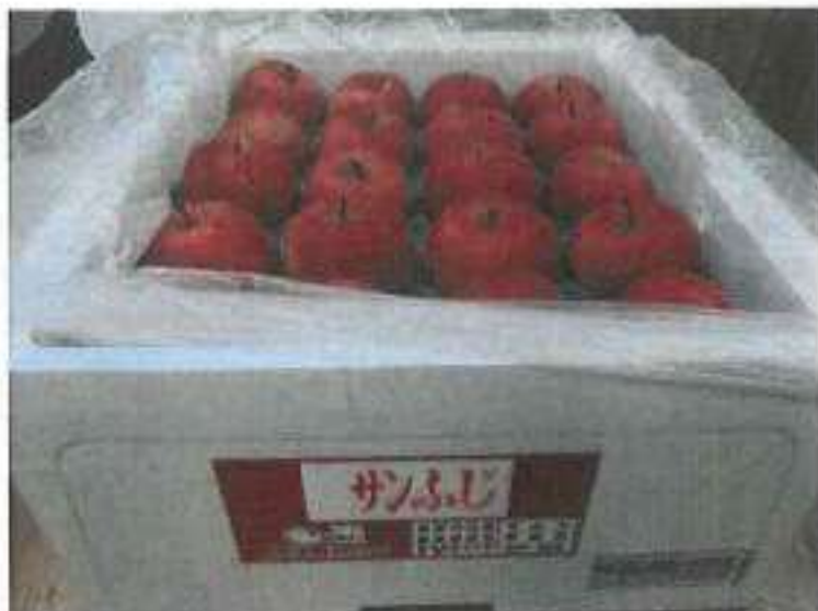
Photo No.16: Variety: Sun-Fuji, 3 rd grade with size: 40s: Unpacked for inspection.