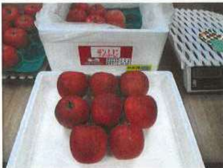
Photo No.23: ---- Ditto ---- The condition with ratio of damage: Superficial Scald: 23.2% Bruising: 1.8%