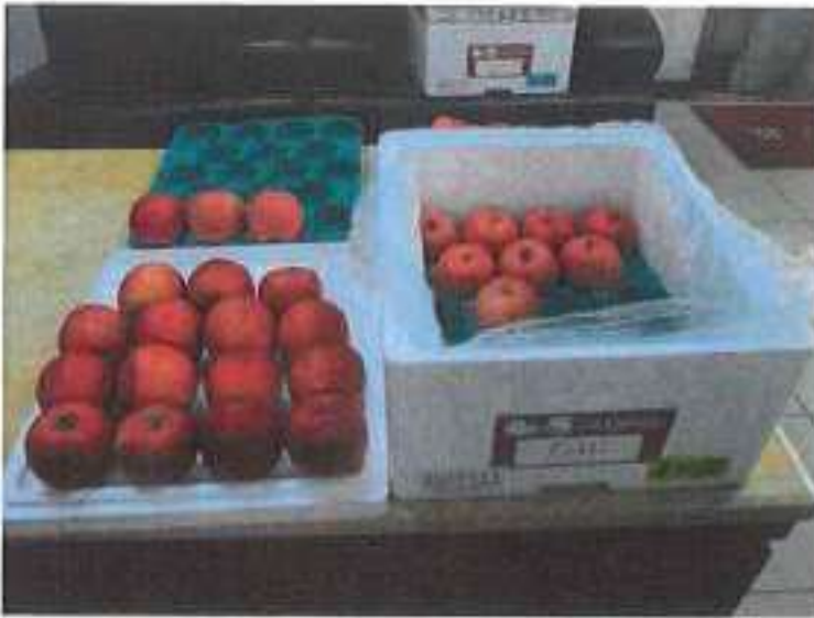
Photo No.7: Grade: Yellow Tokusen 2 nd grade with size: 36s. The condition with ratio of damage: Stem Puncture: 4.2% Superficial Scald: 29.2%