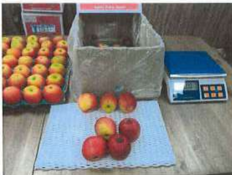
Photo No.51: ----- Ditto ----- The condition with ratio of damage: Stem Puncture: 1.7% Superficial Scald: 2.0% Bruising: 0.6% Russet: 1.1%