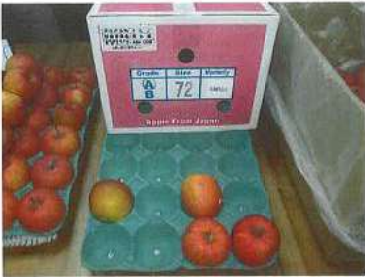
Photo No.43: ---- Ditto ---- The condition with ratio of damage: Stem Puncture: 1.4% Superficial Scald "YAKE?": 1.0%