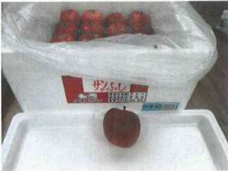
Photo No.19: ----- Ditto ----- Superficial Scald in another carton.