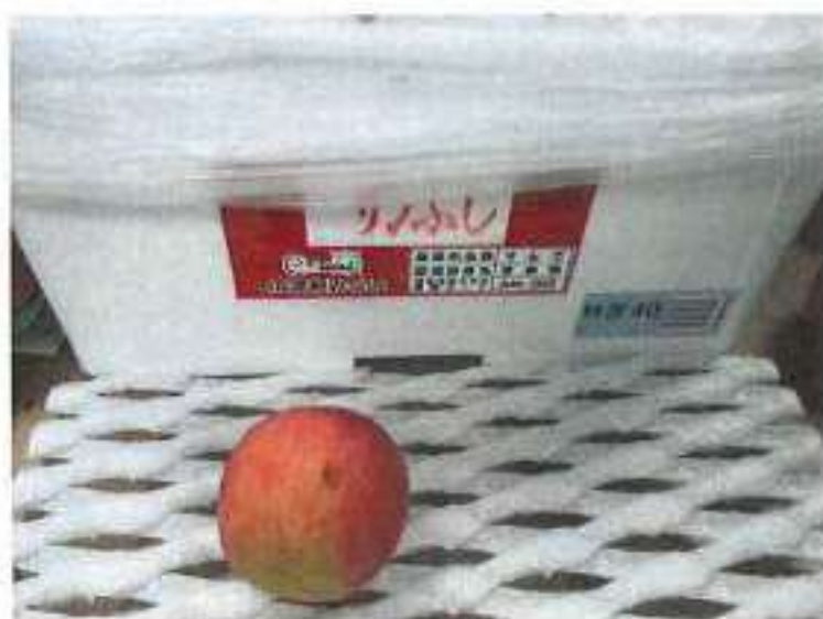
Photo No.17: ---- Ditto ---- The condition with ratio of damage: Stem Puncture: 1.3% Superficial Scald: 1.3%