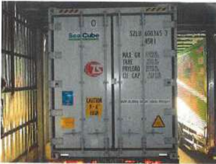
Photo No.1: Carry container SZLU6003653/40HQ was apparently in normal condition without remark on E.I.R., but the power had been off on arrival at cold storage.