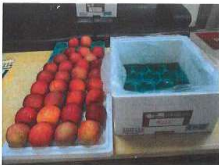
Photo No.19: Grade: Blue Tokusen 3 rd grade with size: 36s: The condition with ratio of damage: Stem Puncture: 6.9% Superficial Scald: 69.4%