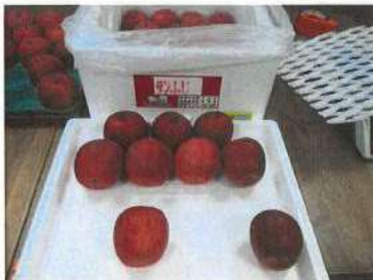
Photo No.35: The condition with ratio of damage: Bitter Pit: 1.4% Superficial Scald: 19.5% Bruising: 1.4%