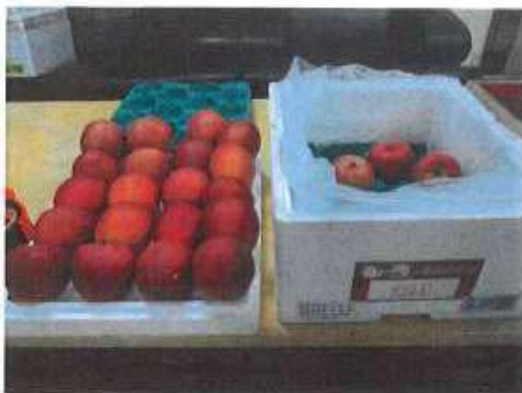
Photo No.13; Grade: Blue Tokusen 3 rd grade with size: 28s. The condition with ratio of damage: Stem Puncture: 3.6% Superficial Scald: 66.1%