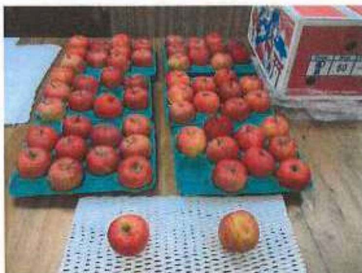
Photo No.44: The condition with ratio of damage: Stem Puncture: 1.7% Bruising: 0.8% Superficial Scald: 0.8%