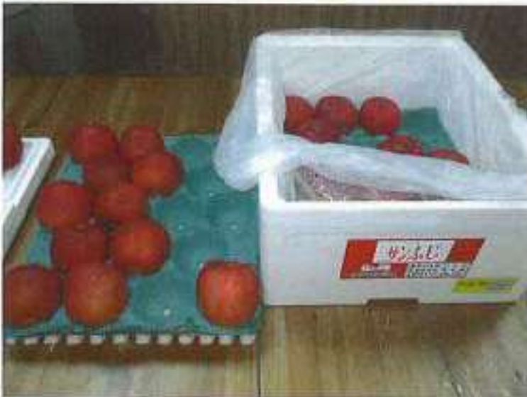
Photo No.26: ---- Ditto ---- The condition with ratio of damage: Stem Puncture: 1.4% Superficial Scald "YAKE": 23.6%