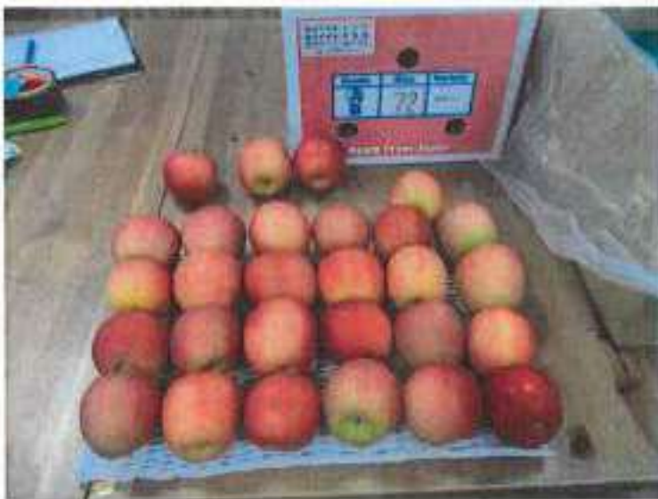
Photo No.29: ---- Ditto ---- The condition with ratio of damage: Bruising: 1.4% Stem Puncture: 0.7% Superficial Scald: 30.6%