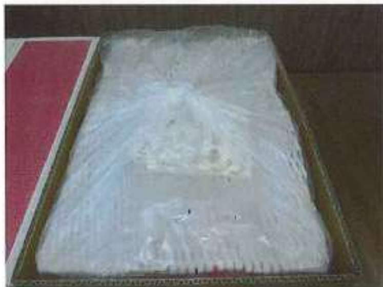
Photo No.41: Every 24 pcs. were put on a paper tray then 3 trays were piled into 3 tiers to be wrapped in a plastic bag and then was packed in one carton box.