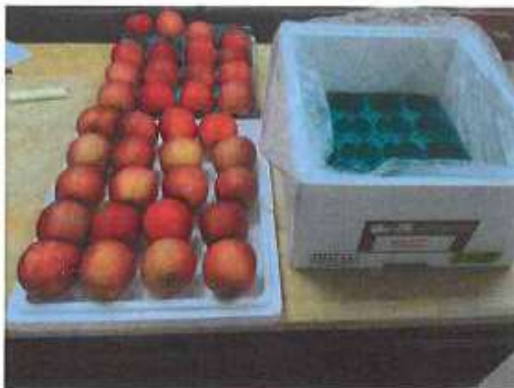
Photo No.10: Grade: Yellow Tokusen 2 nd grade with size: 40s. The condition with ratio of damage: Stem Puncture: 3.8% Superficial Scald: 78.8%