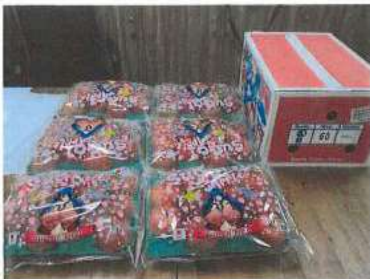
Photo No.43: Variety: Sugoi Sun-Fuji, A grade with size: 60s: Unpacked for inspection.