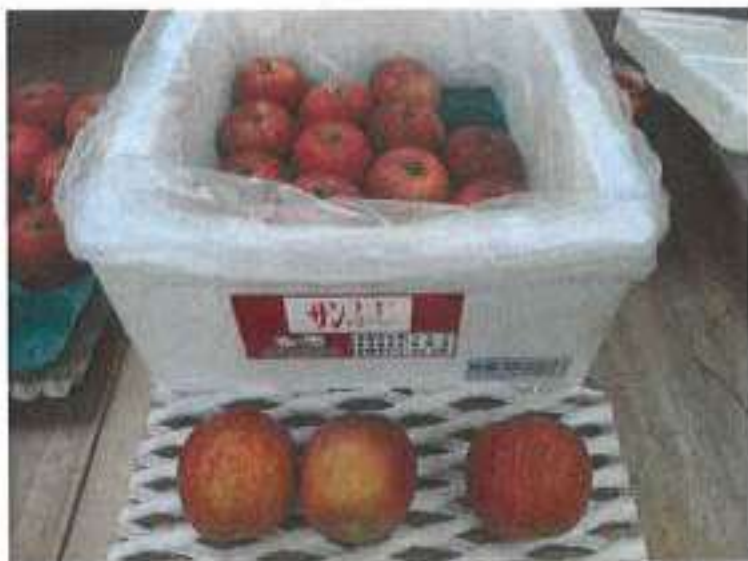
Photo No.10: ---- Ditto ---- Stem Puncture & Bruising in another carton.