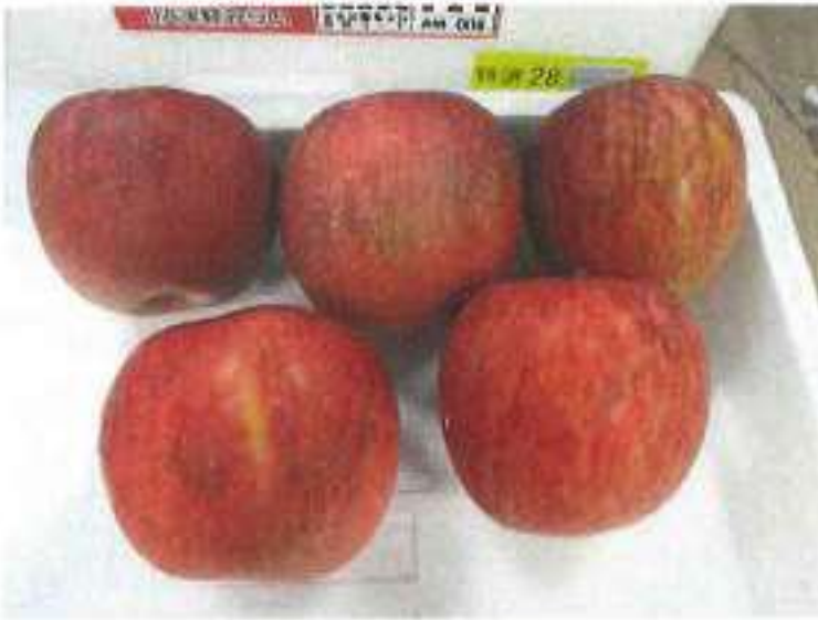
Photo No.25: ---- Ditto ---- Superficial Scald in another carton. (Close view)