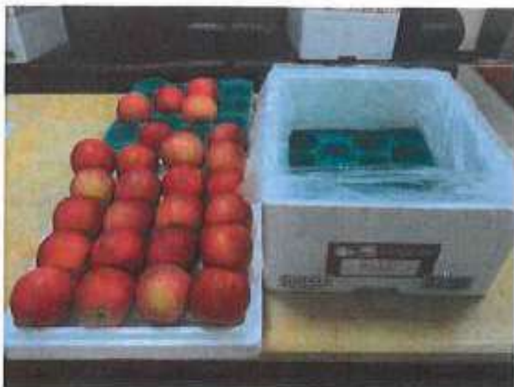
Photo No.16: Grade: Blue Tokusen 3 rd grade with size: 32s. The condition with ratio of damage: Stem Puncture: 11.0% Superficial Scald: 67.2%