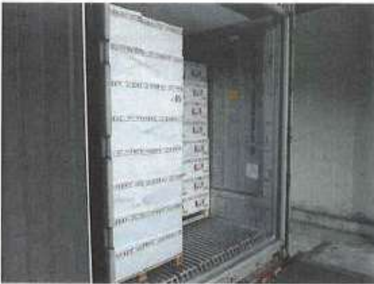
Photo No.1: Carry container SZLU6006950/40HQR was apparently in normal condition without remark on E.I.R., but the power had been off on arrival at cold storage.