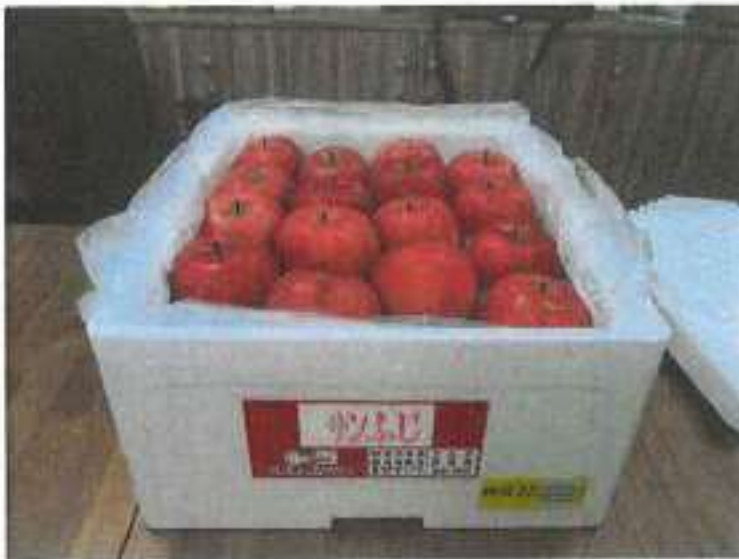
Photo No.28: Variety: Sun-Fuji, 2 nd grade with size: 32s: Unpacked for inspection.