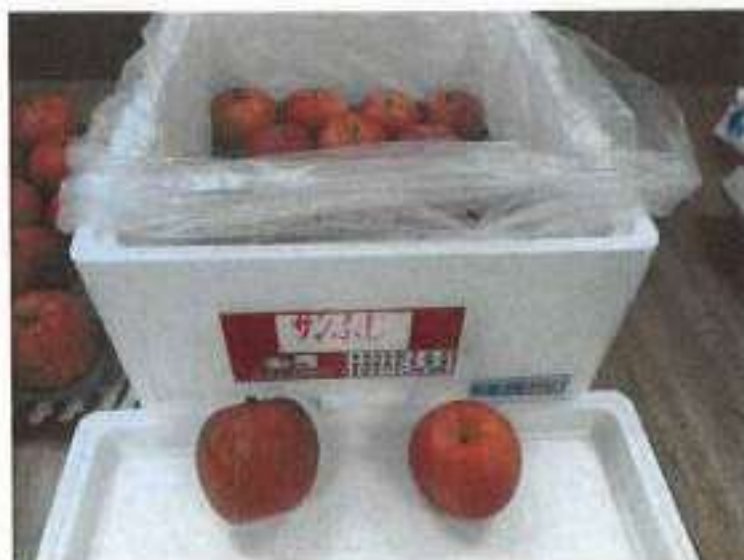
Photo No.14: ---- Ditto ---- The condition with ratio of damage: Stem Puncture: 1.4% Superficial Scald: 1.4%