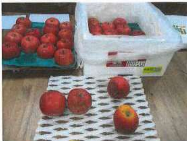
Photo No.29: The condition with ratio of damage: Stem Puncture: 1.6% Superficial Scald: 7.8% Decay: 1.6%