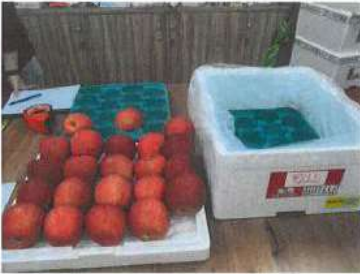
Photo No.7: Grade: Yellow Tokusen 2 nd grade with size: 32s. The condition with ratio of damage: Stem Puncture: 4.7% Superficial Scald: 56.3%