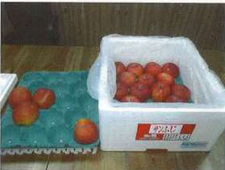
Photo No.11: ---- Ditto ---- The condition with ratio of damage: Stem Puncture: 1.4% Superficial Scald "YAKE": 7.0%