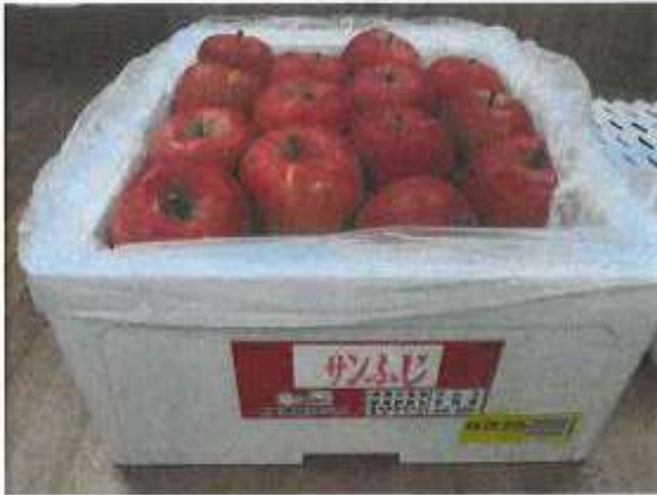
Photo No.22: Variety: Sun-Fuji, 2 nd grade with size: 28s: Unpacked for inspection.